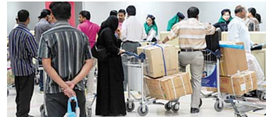
BUSY HUB: The total passenger traffic through Muscat Airport until August this year has increased by 13 per cent.

Muscat International Airport, aviation statistics indicate an increase in the total unloaded and loaded freight by 3 per cent, with total shipment of 65,800 tonnes compared to 63,907 tonnes in the same period last year.