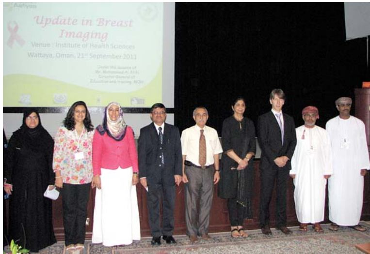
SPREADING AWARENESS: The conference was jointly organised by Aafiyaa Imaging and Diagnostic Centre LLC, a standalone ultrasound and mammography centre, along with Oman Association of Radiographers. It focused on radiological diagnosis of breast cancer and its role in the treatment plan.

From 1997 to 2009, 1,111 individuals were diagnosed with breast cancer in Oman. Mammography is still the gold standard in early detection of breast cancer. Ultrasonography, MRI and PET also have their own roles